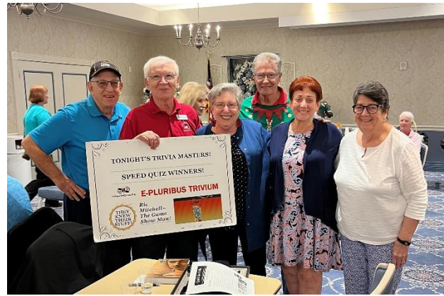
Winners of Trivia Contest